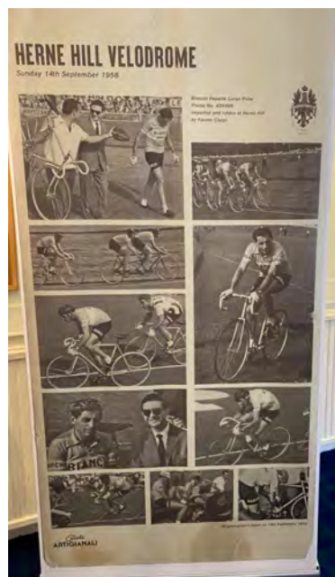
At Herne Hill 1958