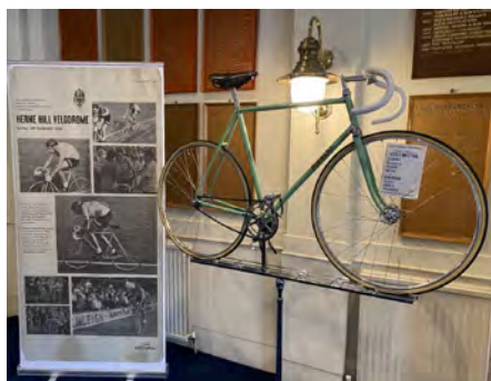
The great man's track bike

As many of you will know, Fausto Coppi was an all round racing cyclist winning many of the 'big' races multiple times. His exploits dominated the sport either side of WW2, so what would he had achieved, if his career hadn't been interrupted by the War? He died of malaria at the early age of 40 in 1960.