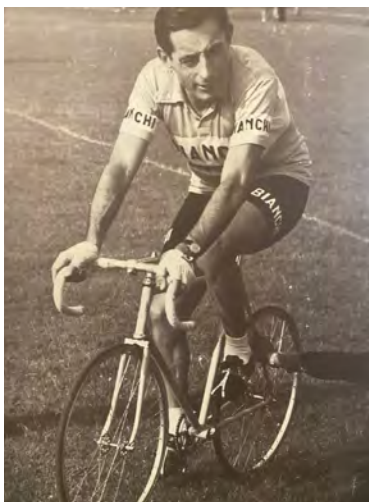
The Great Coppi