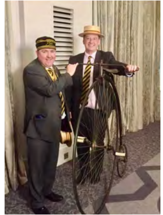
President & Captain

My connection with the bicycle trade began when I joined the family bicycle business in the early 80s. My maternal grandfather, had set up a very successful wholesaler called Southern Trading Co, supplying London and the Southeast with both electrical and bicycle goods, stocking Tri-ang Toys, Raleigh bicycles and everything in between. A tour around the tables at a Pickwick lunch brings back fond memories with the presence of many familiar retailers and suppliers. After 75 years of trading, my brother and I left the bicycle trade to concentrate on expanding a property portfolio which, ironically, still includes two bicycle shops one of which predates our esteemed Club!