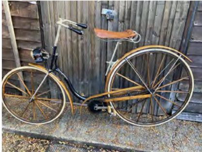
Mr Watty's wooden framed machine from the USA

I would also like to thank one of my guest, Deniz for filming this year's event, and with luck there should be a QR code within the magazine on page17, so all involved can relive the day, if they are bored with NetFlix!