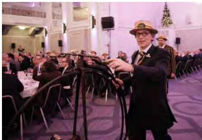
The Original Member