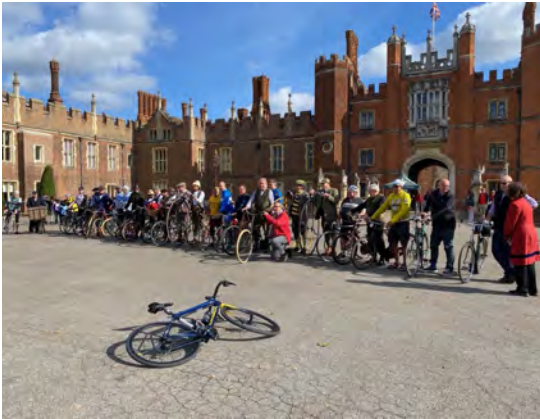
The Pickwickian Family at The Palace