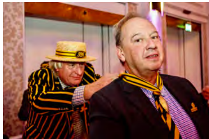
Chain of Office Handover