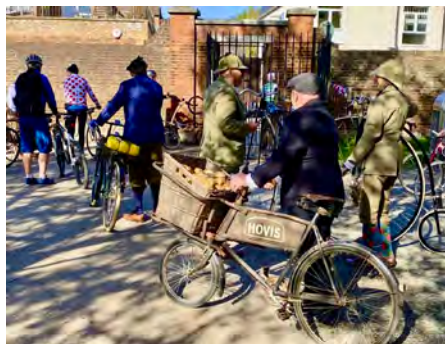
Waiting at the Gates