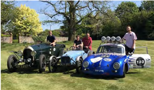
The President's other passion

Over the years I have collected one or two older bikes which I hope to dust down and bring along to some of the Pickwick run meetings. I am also very fortunate to have a patient and understanding wife who allows me to collect vintage cars, and I try to regularly compete on the track, roads and even grass. A '58 Cannon Trials car for the muddy winter hills, a 1923 Bentley that will be racing at this year's LeMans Classic, an early Porsche that races on ice and a 1955 LT Special, that races annually in Mexico.