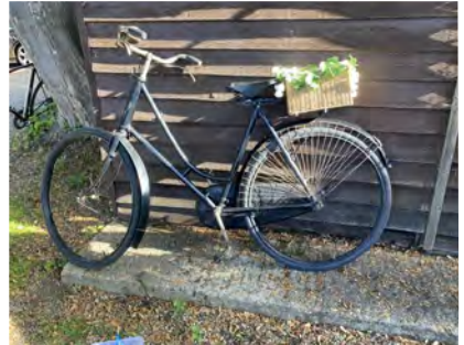
A decorated machine from the 1920's

We took a different route this year once we got to Bushy Park, and nobody got lost as we made our way to The Star pub for the usual snack stop, to give us strength to make it back for lunch, where we were joined by the 'lycra louts'. The weather could not have been better for this year's ride, which made it a tough decision to leave the pub garden and this gave us a chance to view some of the vintage bicycles in action on the day.