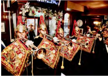
Clearing The Pillars

The Household Cavalry trumpeters had done their job well, having cleared the Hercules Pillars of waifs & strays, and got us all to our tables on time. The Captain was clearly in control this year having missed last year, but, he had little need to bring the gathering to heel, as everyone was behaving themselves. Thus far at least.