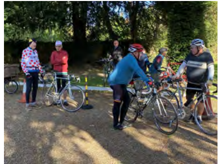
Waiting for the start

One of my favourite jobs each year on the day, is to decide who is worthy of a trophy for either lack of maintenance of their machine or gets lost or any other misdemeanour. But this year riders and machines behaved impeccably, making my job almost impossible! Cycles and riders perfectly turned out, the whole event running like clockwork! So for the presentations of the day, luckily for me, the modern invention, the mobile phone came to my aid!.