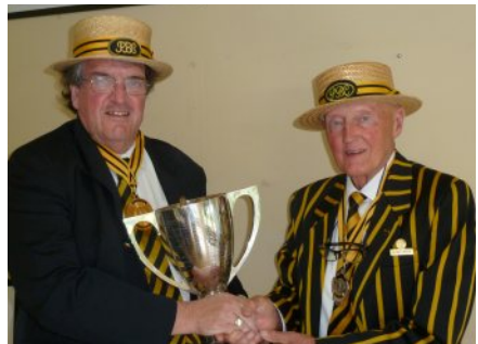
At The Golf Day