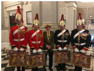
I thought I might sign up again