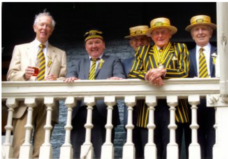
At the Past President's Lunch