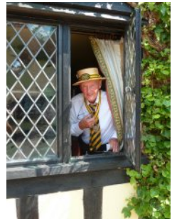
At the Leather Bottle